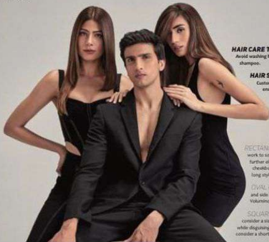
Styling: Geetanjali Salun

SQUARE FACE To complement bone structure, women should consider a side-parted style. Long and airy layers can also be flattering while disguising the sharp angles of their face. If you like a short length, consider a short, layered bob.